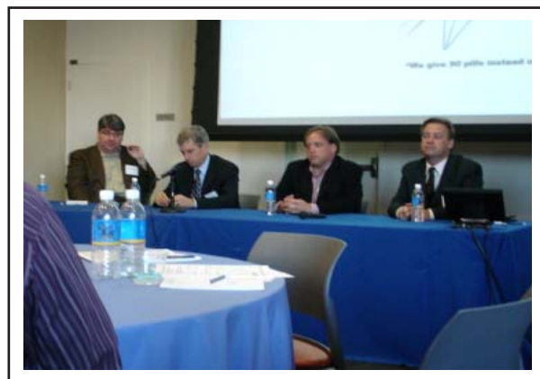
Panel Member Q&A Session