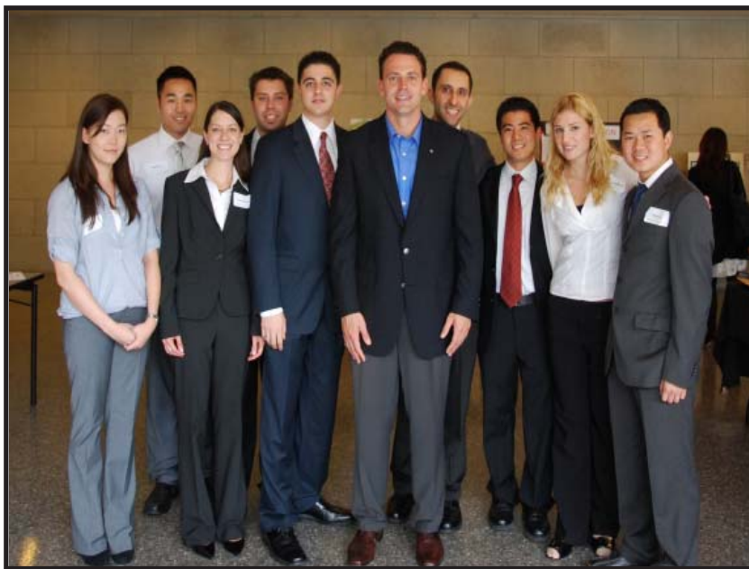
The SSPPS Legislative Day Committee with Assemblyman Nathan Fletcher.