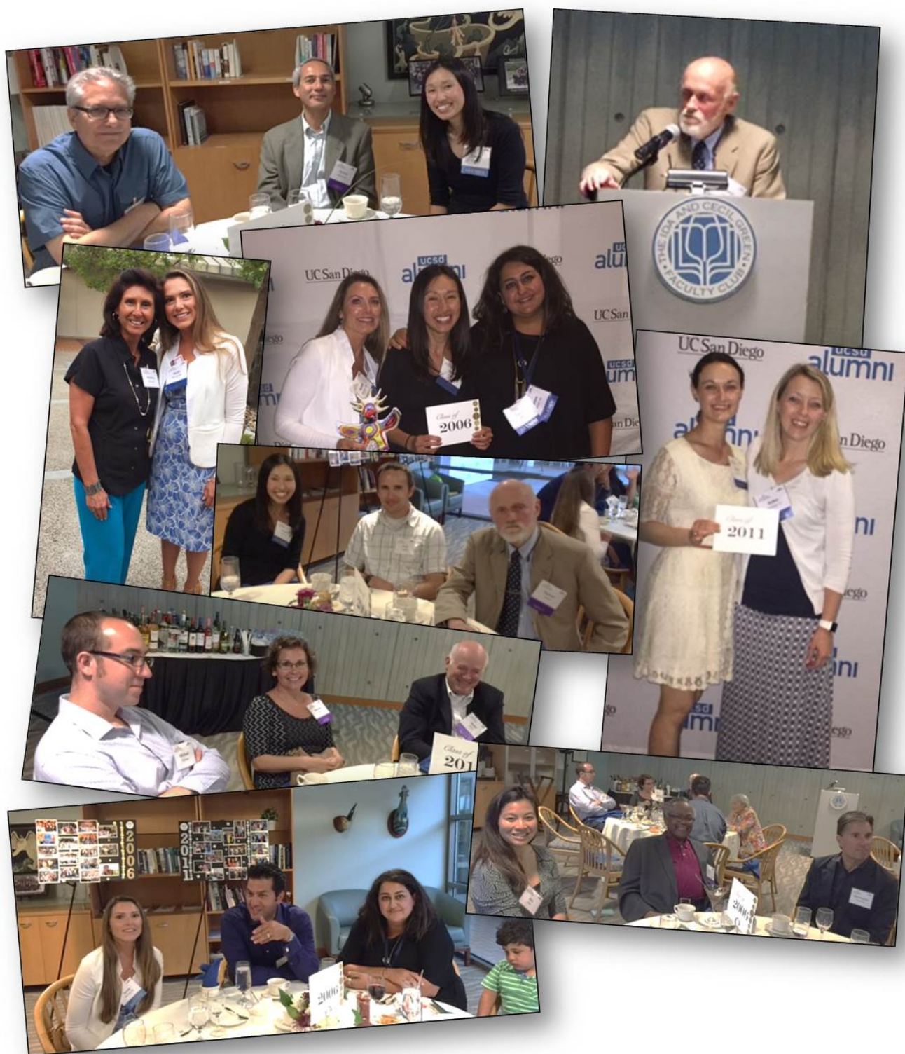
Dinner at the UC San Diego Faculty Club