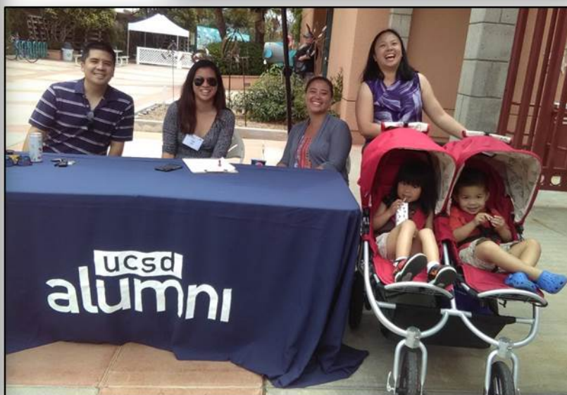
Family time at the Birch Aquarium at Scripps Institution of Oceanography