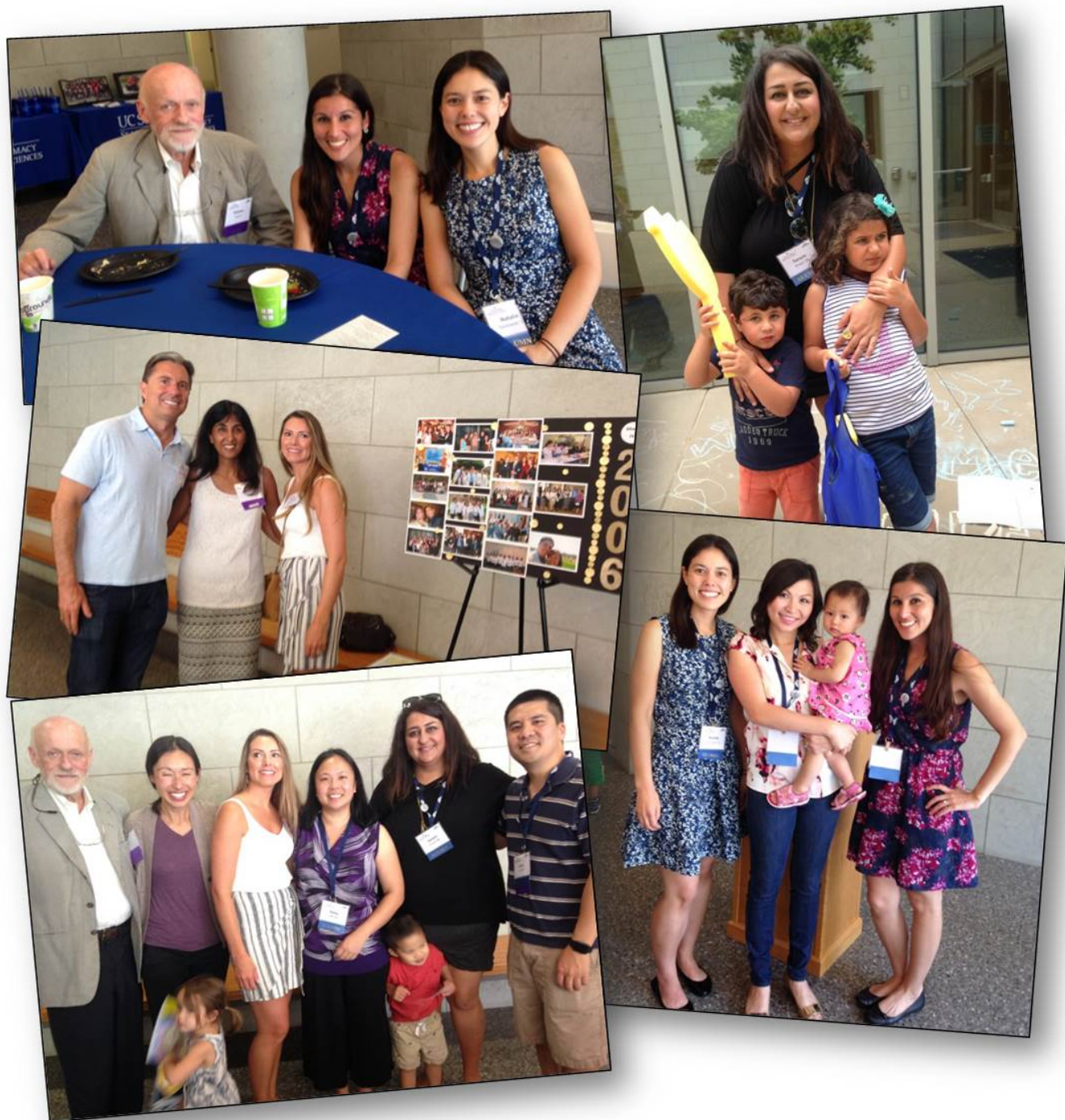
Brunch at the Skaggs School of Pharmacy and Pharmaceutical Sciences