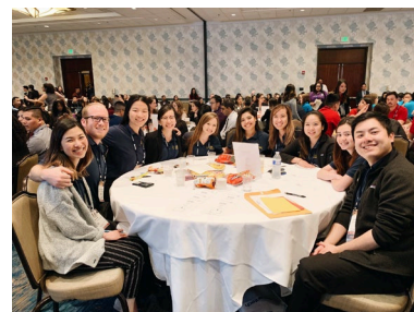
A picture of our team as they get ready to compete for the Quiz Bowl

Another highlight from this year's Seminar came during CSHP's annual Quiz Bowl Competition. Led by a group of determined P4s, UC San Diego students battled other schools as they attempted to answer jeopardy style questions on topics ranging from pharmacokinetics and