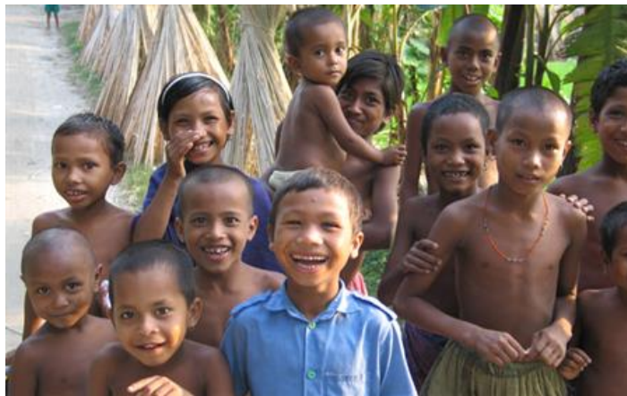
These children live in Bangladesh, where UC San Diego researchers are leading a clinical trial to determine if a repurposed rheumatoid arthritis drug can be used to treat amebiasis and giardiasis.

UC San Diego researchers use robotic technology to screen hundreds of thousands of chemical compounds from a variety of sources — including drugs abandoned by pharmaceutical companies and marine natural products — for their ability to kill parasites while leaving human cells unharmed. More than