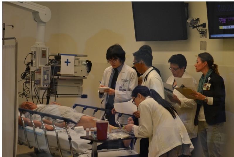
(All parties approved this photo to be shown in this newsletter.)

The goal of this specific exercise is all about practicing teamwork. Students are divided into inter-professional teams comprised of 2-4 medical students, 1-2 pharmacy students, and 2-4 nursing students. Each team evaluates a patient in clinic. The team huddles together to share their respective professional opinions. As a team, they determine the patient's disposition and decides whether or not to transfer the patient to another student team in the emergency department (ED).