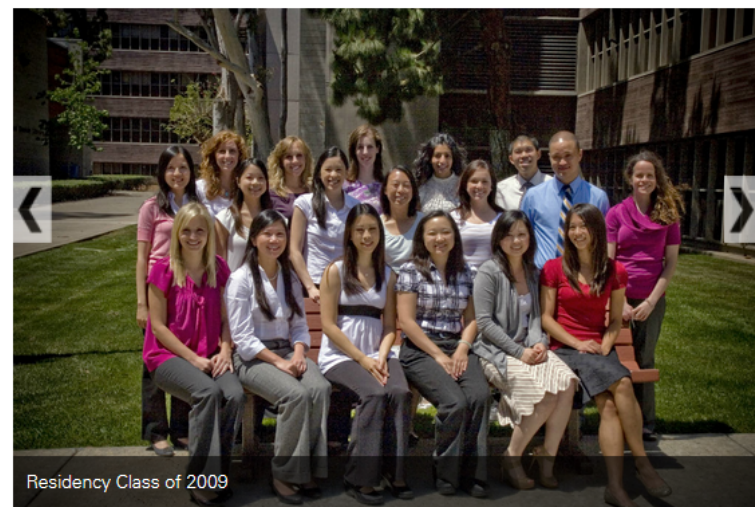
Residency Class of 2009